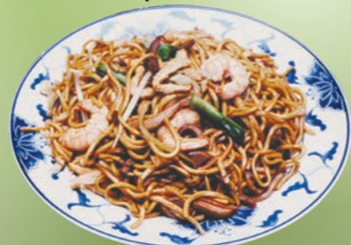
House Special Lo Mein