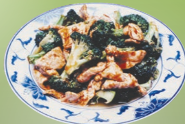
Chicken w. Broccoli