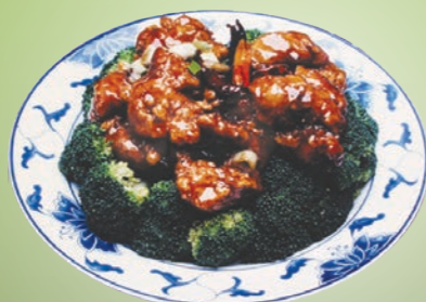
General Tso's Chicken